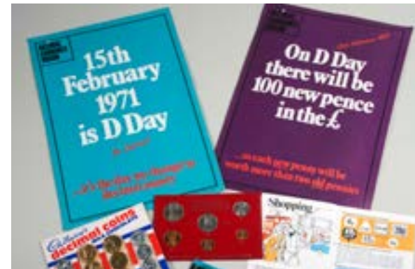
Ephemera advertising 'D Day' – the day English currency changed to decimal. Cadbury's decimal coins, a guide to using decimal and examples of new currency.

https://museumsandgalleries.leeds.gov.uk/leeds-city-museum/