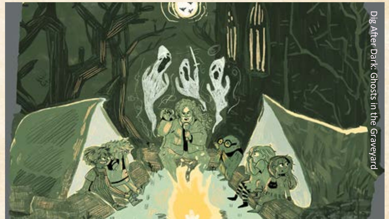
Dig After Dark: Ghosts in the Graveyard

William's Spooky Adventures 28 – 31 October William's Den Castle Farm Wold Hill, North Cave HU15 2LS https://www.williamsden.co.uk/spooky-adventures